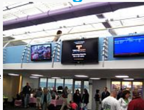
Figure skating includes singles and pairs (same-sex and mixed-sex) divisions with freestyle, artistic, dancing and more categories.

If you're inspired to take to the ice, the 2014 Gay Games is eager to welcome you. Whether you're a newcomer or have years of figure skating experience, you will compete at Serpentini Ice Rink , a training facility where Olympians have trained. (1960 Olympic gold medalist Carol Heiss-Jenkins has been coaching elite skaters for more than 30 years there.)