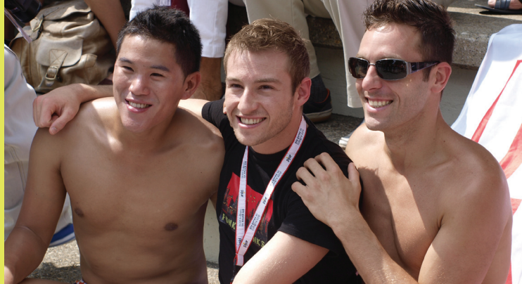
DIVING SENSATION AND OLYMPIC GOLD MEDALIST MATTHEW MITCHAM (PICTURED IN CENTER) AT THE GAY GAMES VIII IN COLOGNE, GERMANY

The Gay Games offers a scholarship program with the Federation of Gay Games. Recipients receive assistance to attend the Games that could include subsidized registration fees, travel or accommodation. Contact the Games for more information.